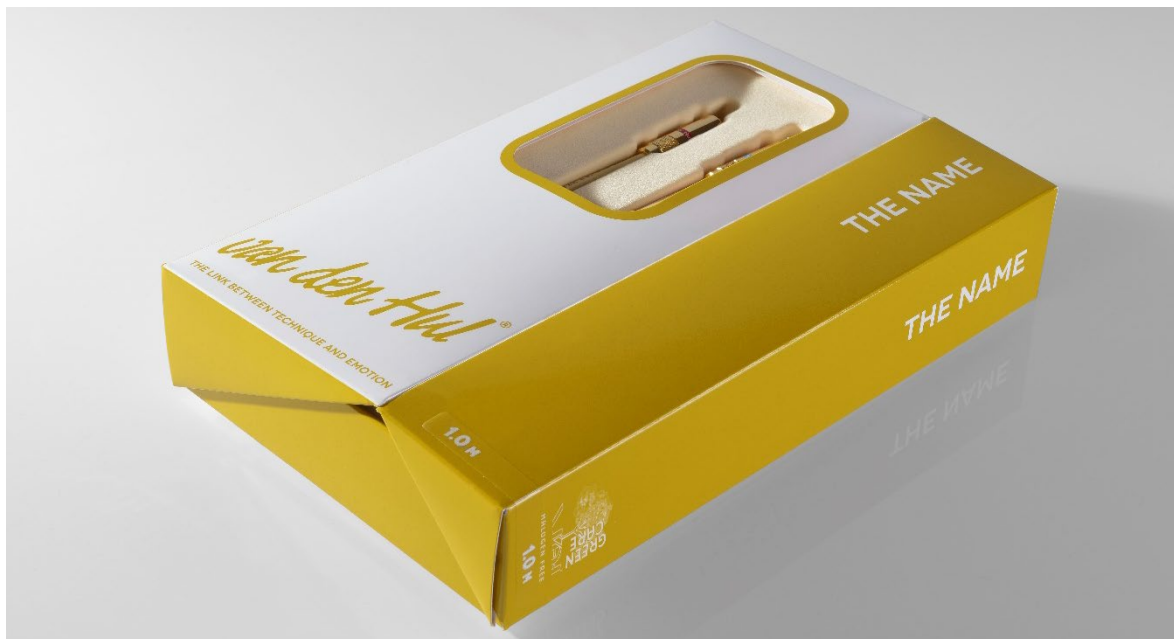
The Name > Halogen Free < Made in E.U.