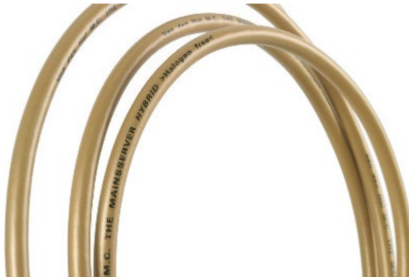
M.C. The Mainsserver Hybrid > Halogen Free < Made in E.U.