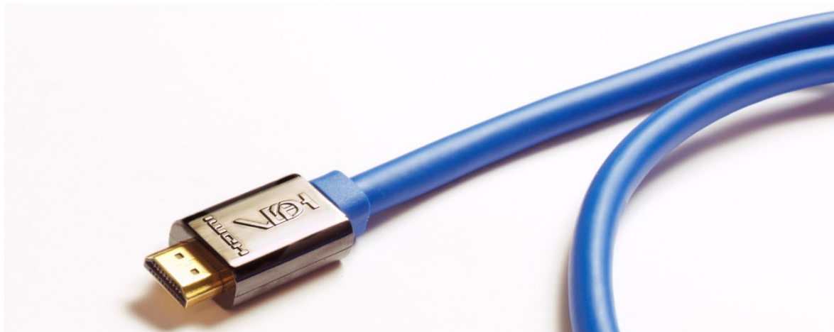
The VDH HDMI Ultimate 4K HEAC > Halogen Free <