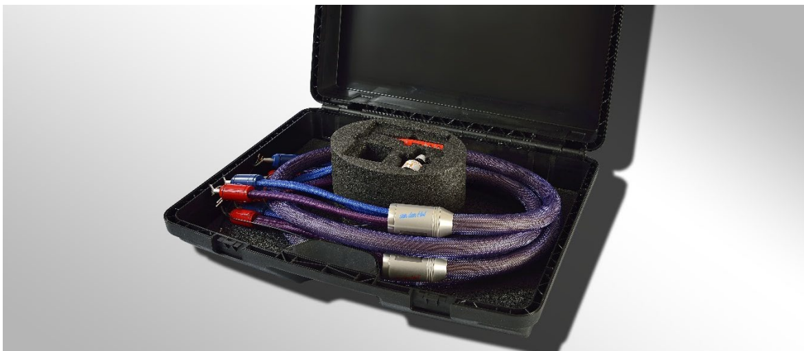
3T The Cumulus Hybrid Limited Edition > Halogen Free < Made in E.U.