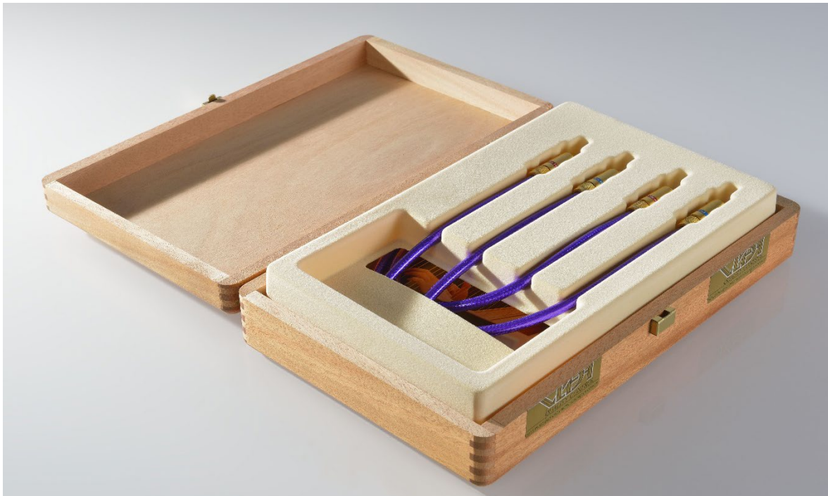
The MC Silver IT 65G > PVC Free < Made in E.U.