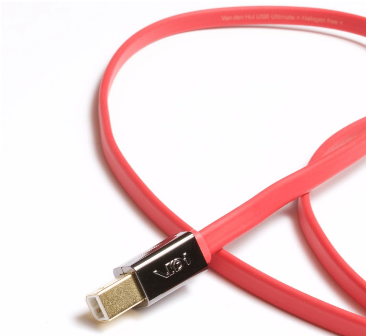
The VDH USB Ultimate > Halogen Free <