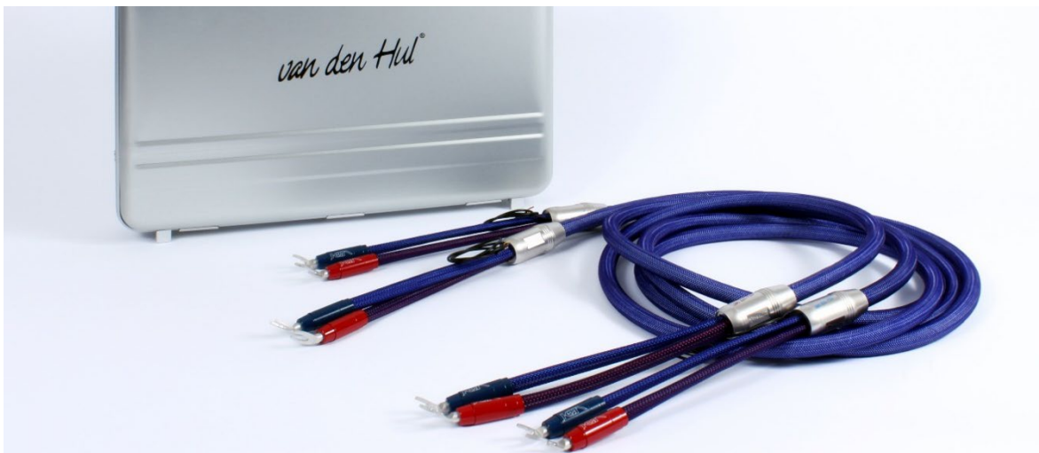
3T The Cloud Limited Edition