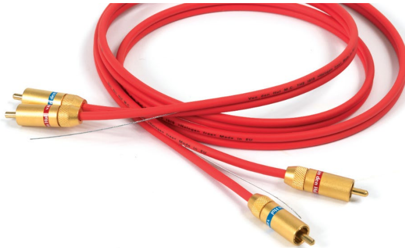
The Isis > Halogen Free < Made in E.U.