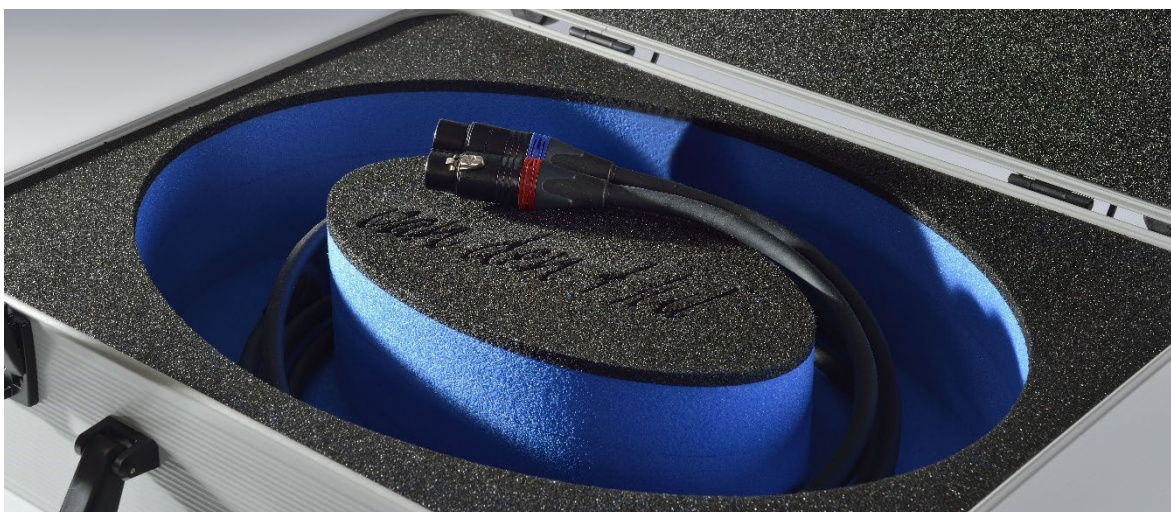
The CNT > Halogen Free < Made in E.U.