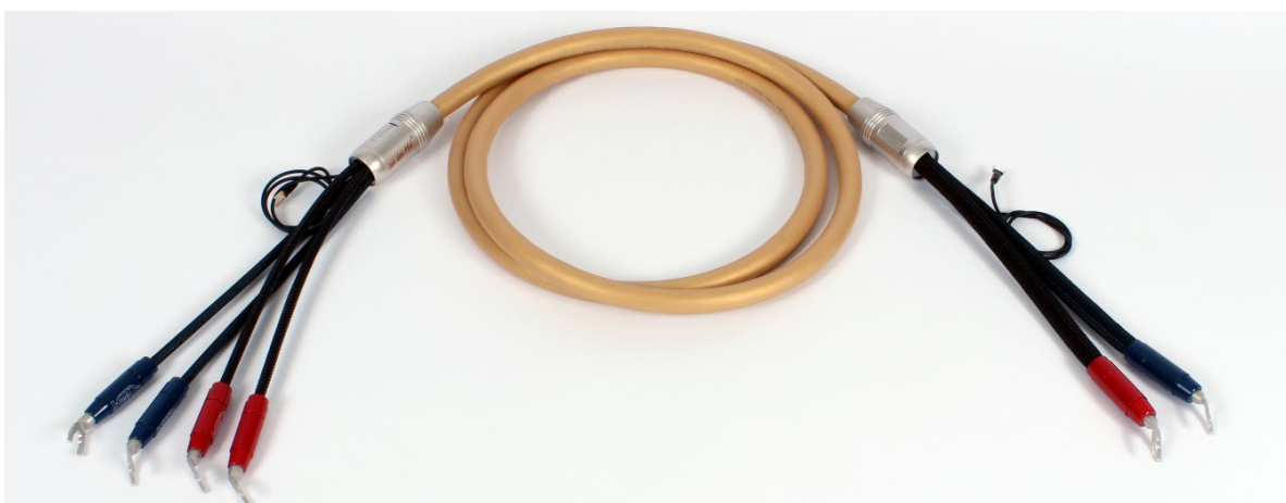
Mounted set 3T The Cloud SE > Halogen Free < Made in E.U.