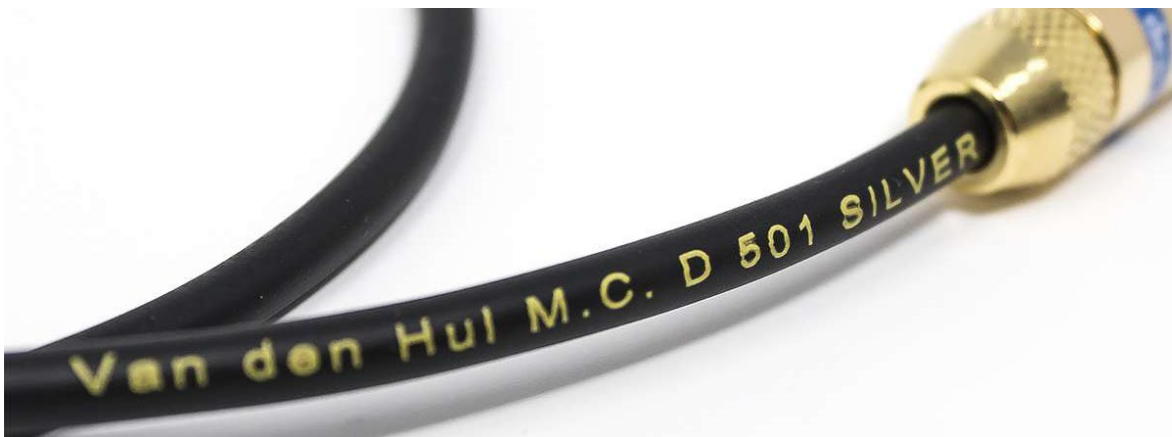
D - 501 Silver Hybrid > Halogen Free < Made in E.U.