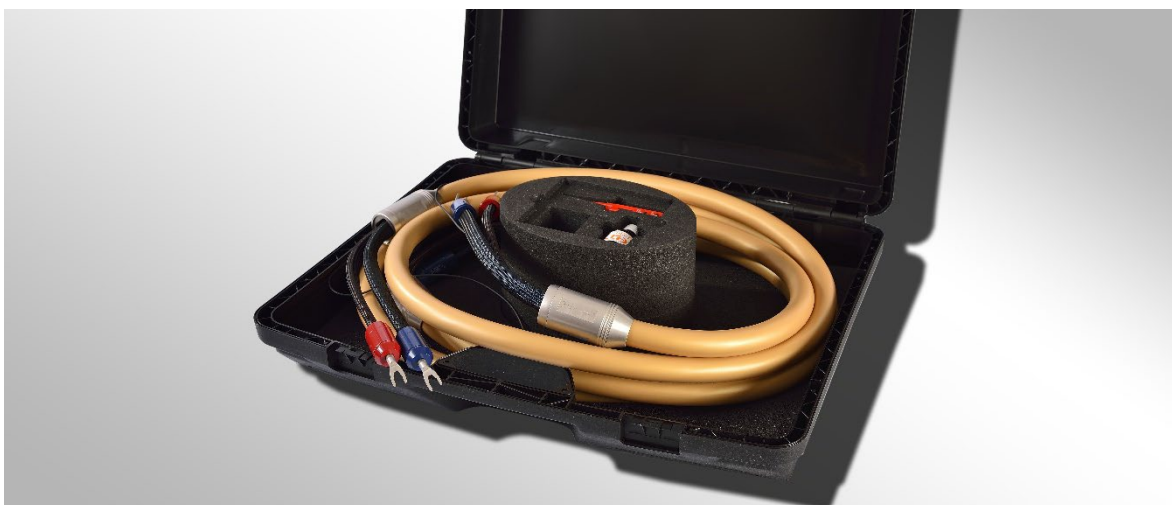
3T The Cumulus Hybrid > Halogen Free < Made in E.U.