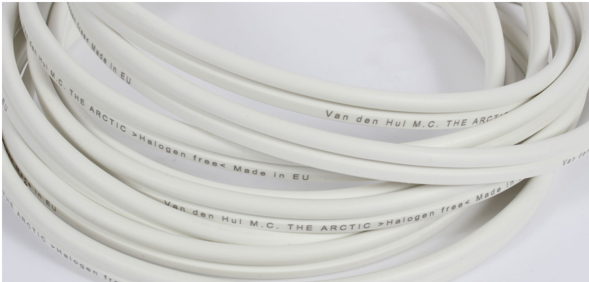
The Arctic > Halogen Free < Made in E.U.