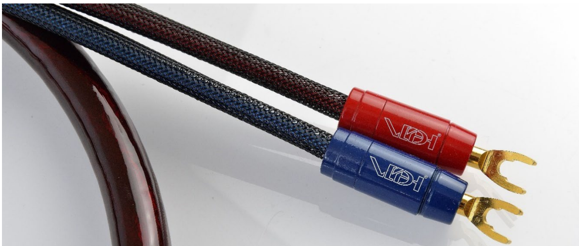
The Super Nova > PVC Free < Made in E.U.