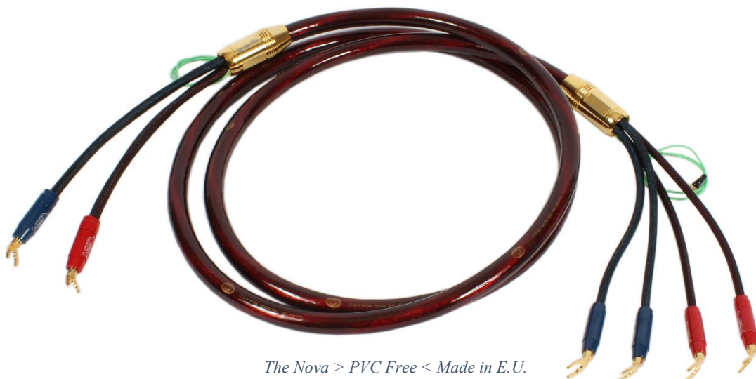
The Nova > PVC Free < Made in E.U.