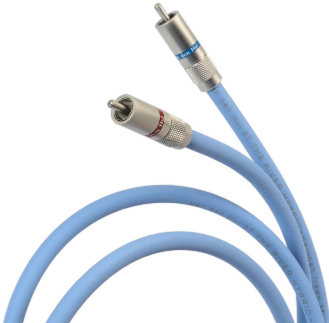
3T The River Hybrid > Halogen Free < Made in E.U.