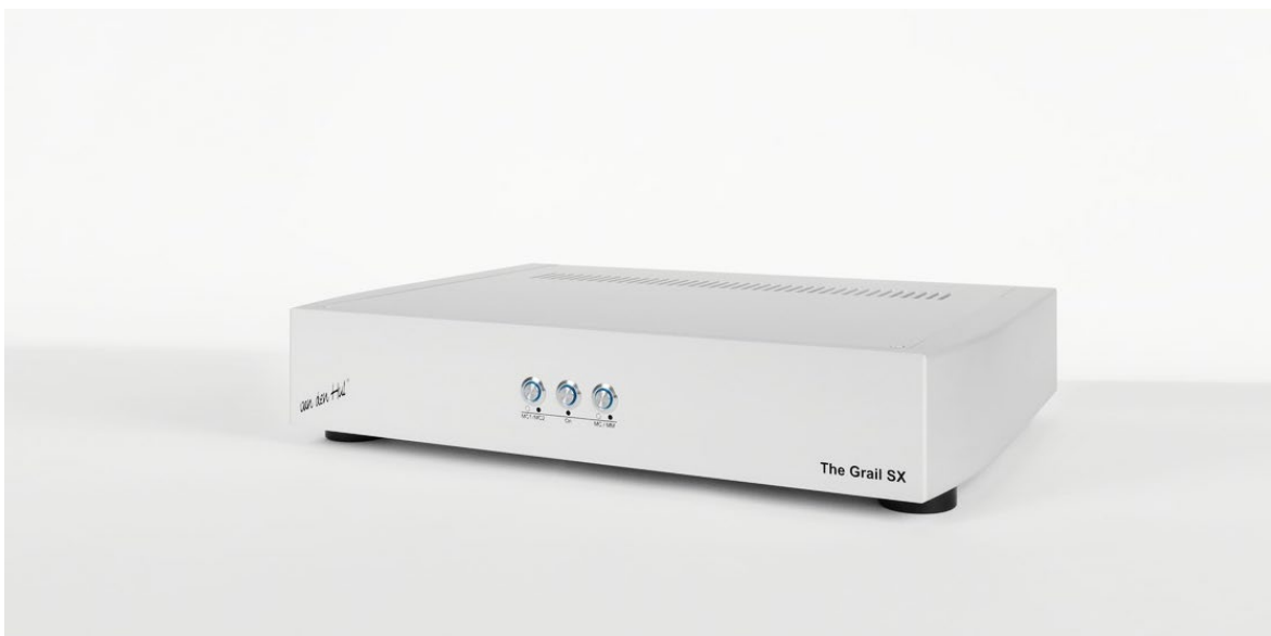
The Grail SX Amp

With this product, you are the owner of one of the most innovative and advanced phonograph preamplifiers available at the moment. It delivers fully balanced inputs and outputs. "The Grail SX" is a really dulcet phonograph preamplifier, specifically designed to bear ultimate performance and reliability in mind.