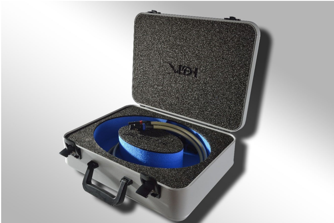
The Platinum Hybrid Mk II Balanced > Halogen Free < Made in E.U.