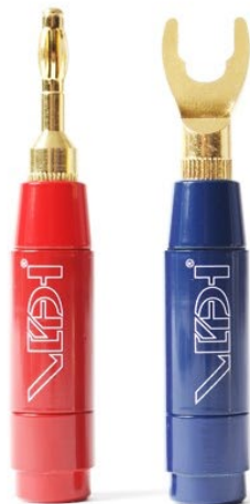
BERRI Bus 8.3mm with spade and BERRI Bus 8.3mm with banana