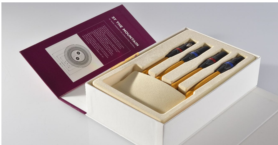
3T The Mountain Hybrid > Halogen Free < Made in E.U.