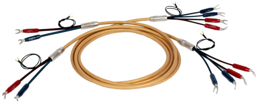
3T The Air > Halogen Free < Made in E.U.